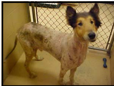
Persy in June of 2002

Please read about Persy - short for Perseverance - at www.mwcr.org . Persy was shot in the face and left for dead. His journey has been miraculous.